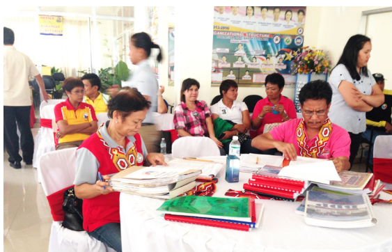
The PTWG of DUNGOG sang Barangay during the Evaluation and Assessment.

The South Cotabato Provincial Technical Working Group (PTWG) of the Dungog Sang Barangay