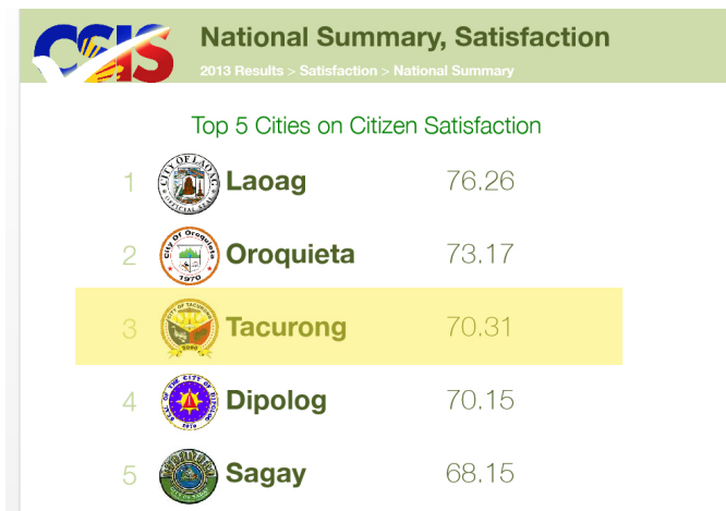
Tacurong City garnered high ratings as National Results were presented during the National Forum on CSIS

The Bureau of Local Government Supervision (BLGS) conducted the National Forum on the CSIS 2013 Implementation cum Orientation-Training for the 2014 CSIS Implementation recently in San Juan City, Metro Manila.