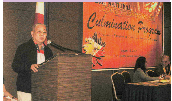
DILG XII OIC RD Reynaldo M. Bungubung, CESE formally opens the NDCM Culmination Activity.

The Regional Disaster Risk Reduction and Management Council (RDRRMC) XII in partnership with the Provincial Disaster Risk Reduction and Management Council (PDRRMC) of South Cotabato launched the observance of the 2014 National Disaster Consciousness Month (NDCM) on June 30, 2014 in Koronadal City.