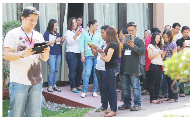
The 3rd batch of GIS trainees trying their hand on geo-tagging using QGIS application for Disaster Preparedness and Response.