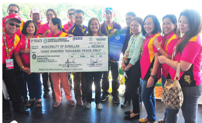
Hon. Gov. Daisy Avance-Fuentes awards the Clean and Green check to the Surallah Municipal Officials.

Clean and Green Program has been institutionalized in the Province of South Cotabato through the conduct of yearly evaluation to all the eleven Local Government Units in the province.