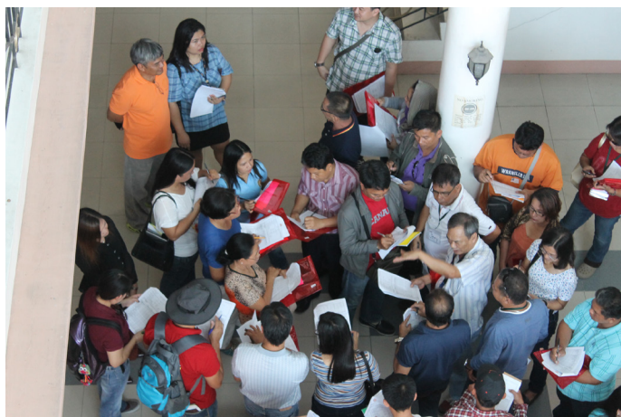
PDs, CDs, MLGOOs and LGU participants during the actual Infra Audit Activity at SoCot Provincial Finance Building.

disaster and climate change. Provincial/City/Municipal Engineers, Provincial/City/Municipal Disaster Risk Reduction and Management Officers, and DILG Field Officers from the following LGUs were provided with the technical assistance on the conduct of the Infrastructure