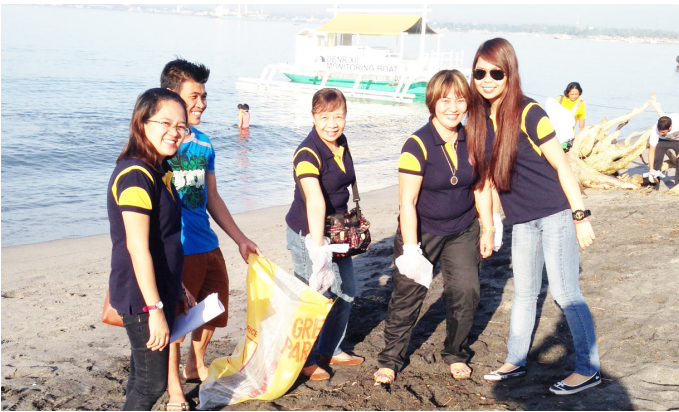
DILG 12 personnel taking part in coastal clean up at Raja Muda Bay.

The DILG 12 personnel recently took part in the Coastal Clean-up Drive and Mangrove Tree Planting at the Queen Tuna Park, Silway, Ba-