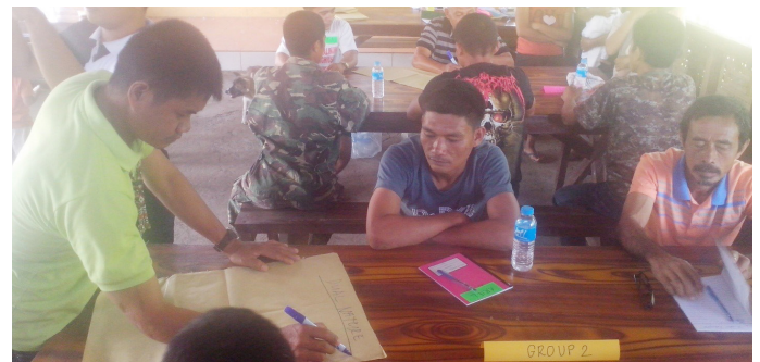
Rebel returnees participate in various activities during the 3-day program.

The provincial government of Sarangani, in coordination with the DILG Sarangani recently conducted a 3-day Culture of Peace Cum Healing and Reconciliation for 25 former rebels in Sarangani at Foxtrot Company, Barangay Banahaw, Malungon, Sarangani Province.