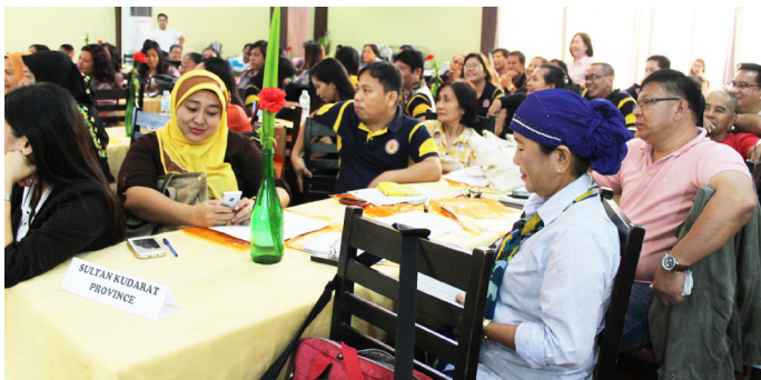
DILG XII Field Officers and Regional Personnel being briefed on the concepts of GAD at Sarangani Highlands Garden.

DILG XII recently conducted the Capability Building for DILG XII Personnel on Gender and Development (GAD) and on the Localization of Magna Carta of Women in General Santos City.