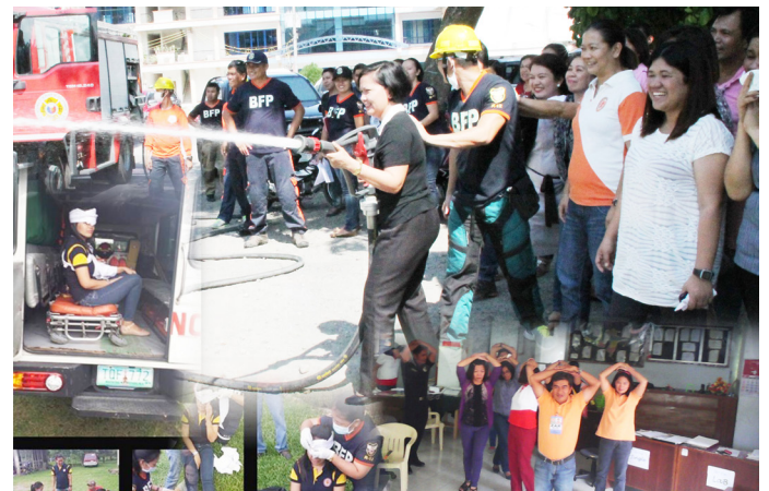
Various shots from the earthquake and Fire Drill done by DILG XII provincial Offices.

Said drills were conducted as part of DILG XII's continuous strengthening of the internal capacity of all its personnel in the aspect of disaster risk reduction and management.