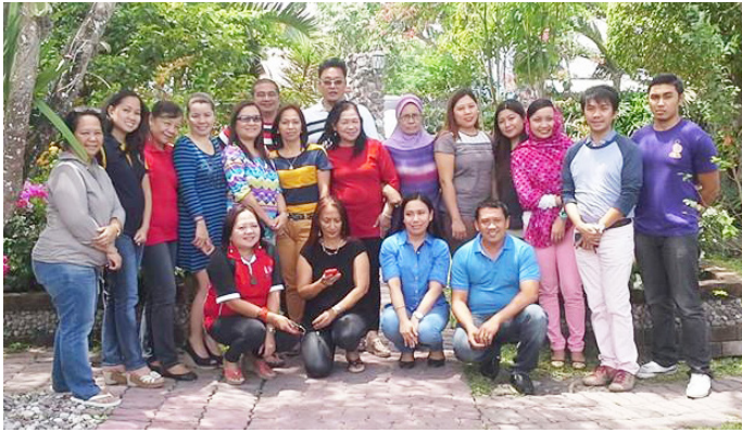
The RAAT XII team with the participants of the activity.

Local health officers, Local Government Operations Officers (LGOOs), Information Officers, and HIV/AIDS Program Managers representing General Santos City, Cotabato City, Kidapawan City, Koronadal City Tacurong City, Glan in Sarangani, Midsayap in Cotabato and Polomolok in South Cotabato recently attended the Regional Anti-AIDS Team (RAAT) XII Orientation of Local Leaders on HIV/AIDS Program in General Santos City.