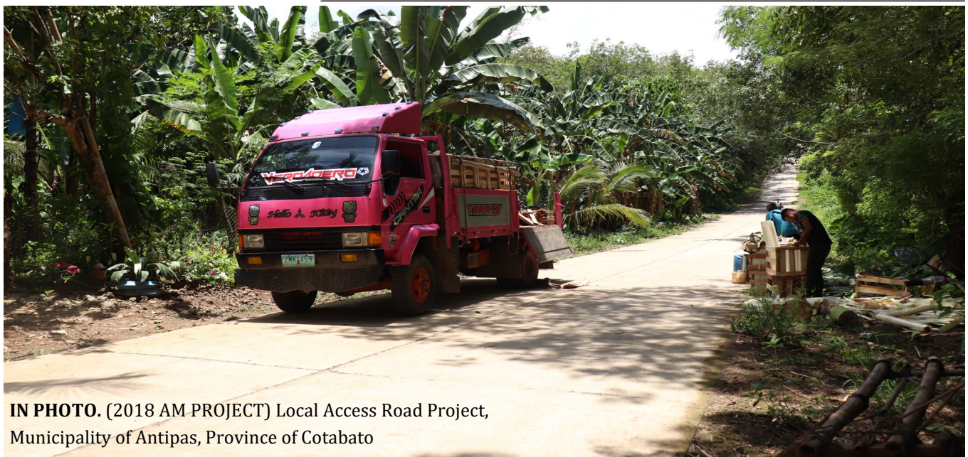
IN PHOTO. (2018 AM PROJECT) Local Access Road Project, Municipality of Antipas, Province of Cotabato

DILG Central Office is set to formally endorse the said projects to the Department of Budget and Management (DBM) for fund release along with other AM proposed projects from other regions.