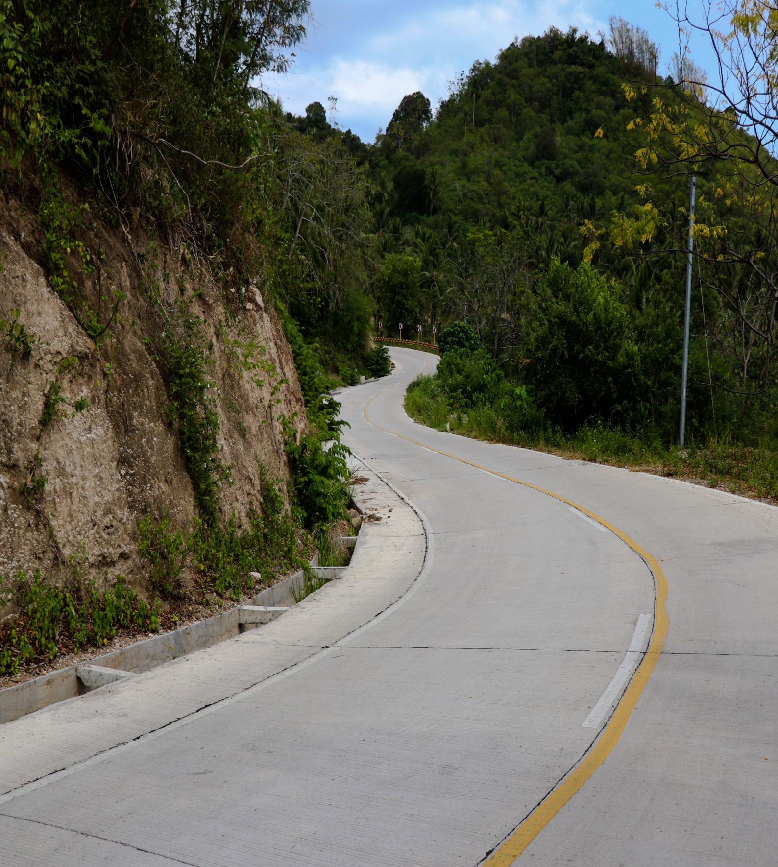
The 2017 CMGP Malbang—Boundary Tboli Provincial Road project worth Php 79,999,989.00 located in the Municipality of Maasim, Sarangani Province.