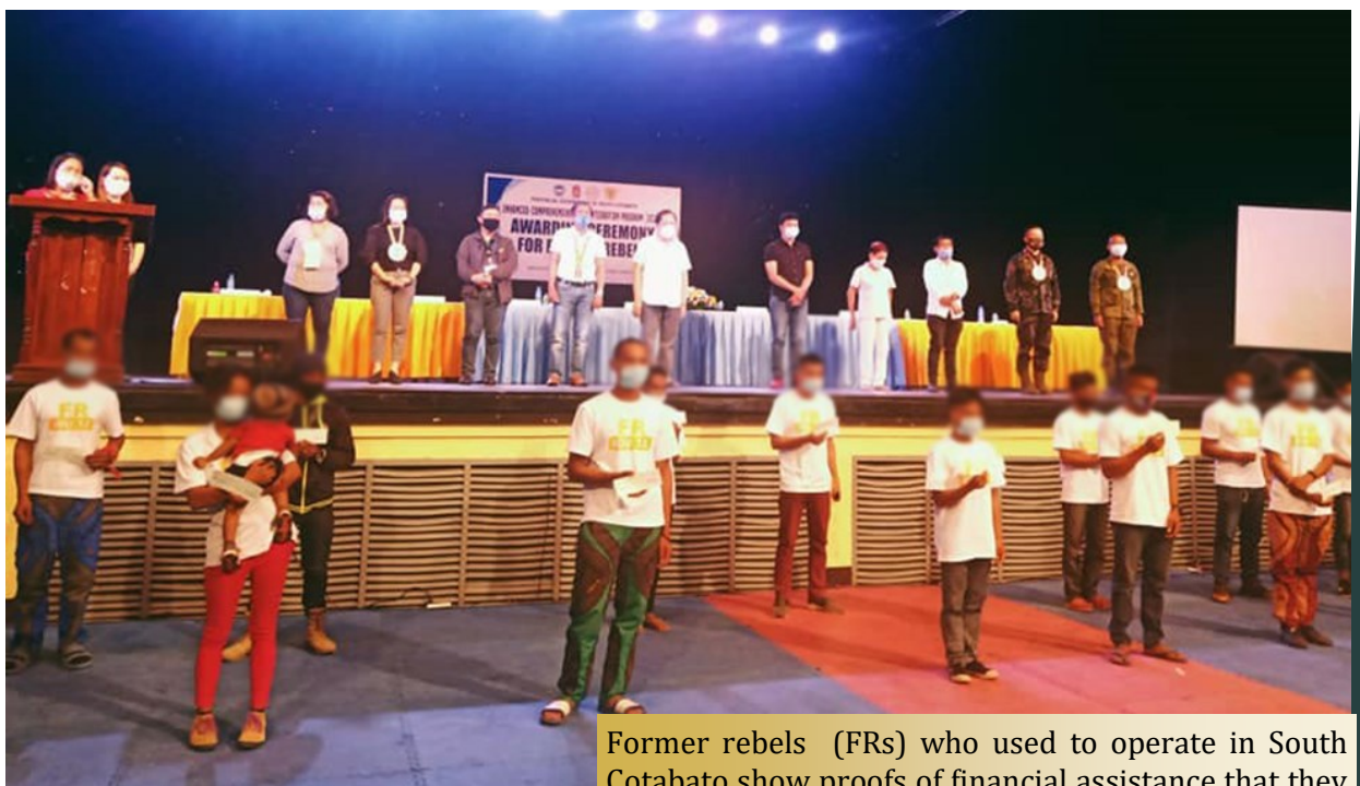
Former rebels (FRs) who used to operate in South Cotabato show proofs of financial assistance that they have received from the government during the ECLIP Awarding Ceremony at the South Cotabato Gym and Cultural Center

The ECLIP is a complete package program for individuals who have decided to abandon armed struggle and return to the fold of the law and join the mainstream of the Philippine society. It is a peace-building and social protection program that provides interventions to Former New People's Army (NPA) Rebels (FRs) and Militia ng Bayan (MB) in becoming productive citizens of society.