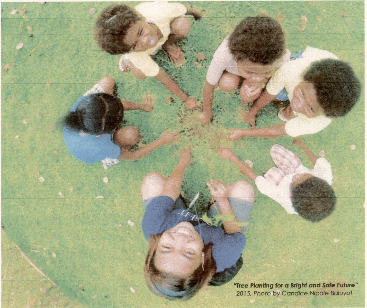
"Tree Planting for a Bright and Safe Future" 2015